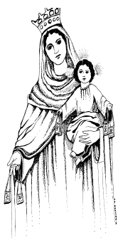
Our Lady of Mount Carmel